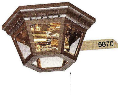
5870 CB10 Size: Large Glass: CB Finish: Anthracite

From Supreme Lighting in Markham (and other outlets - Oxford Model 5870 manufactured by SNOC in St. Hyacinthe, Quebec. (see www.snoclighting.com )