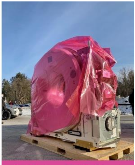
Southlake's new PET-CT delivered